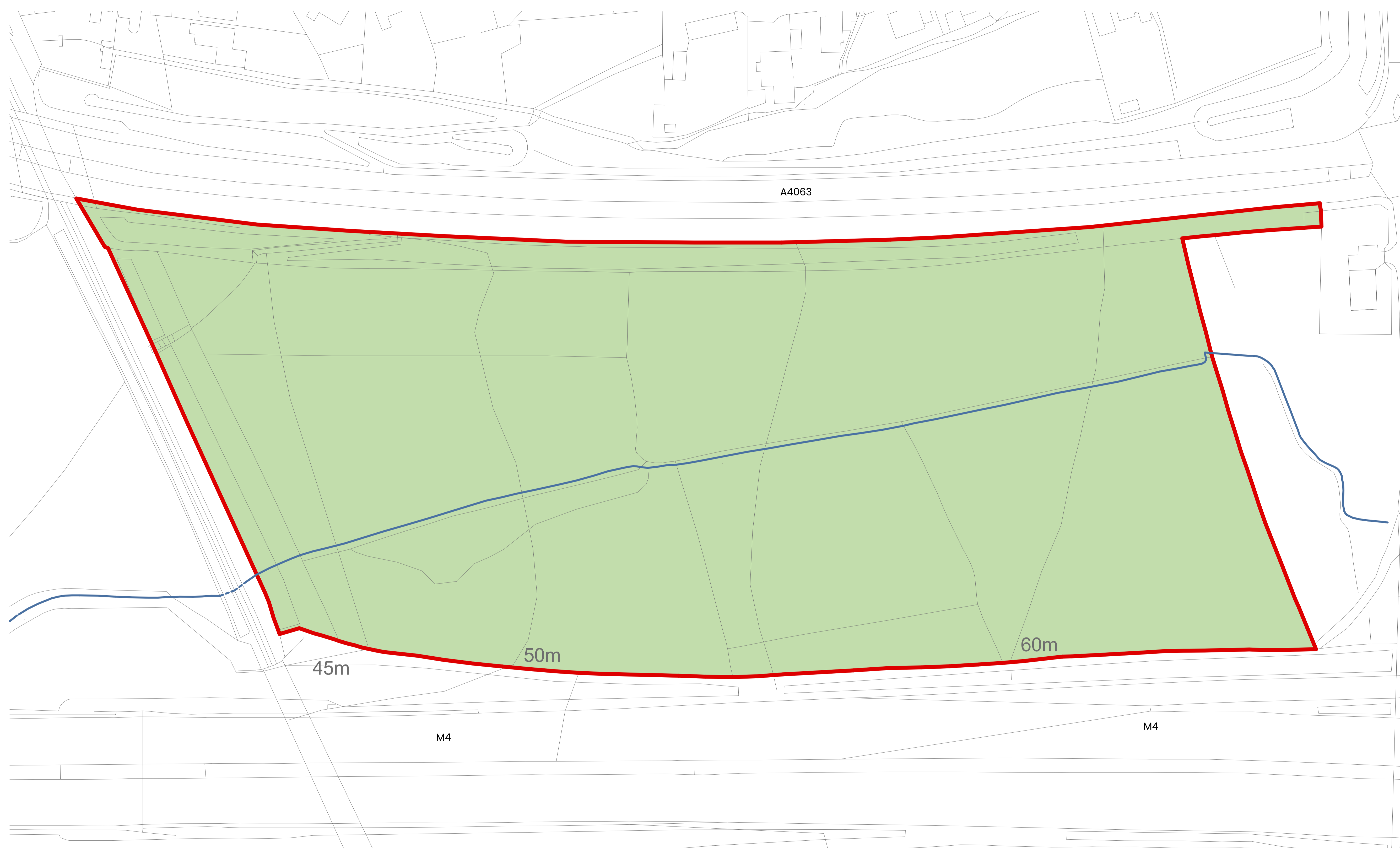
Existing Site Plan 1 : 600